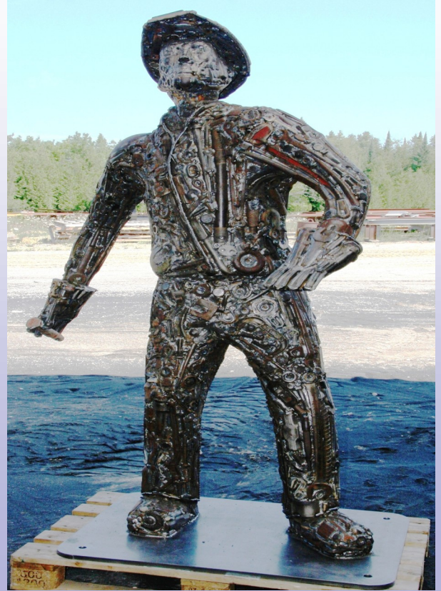
"George" is the first of 3 statues to be placed in the Iron Workers monument